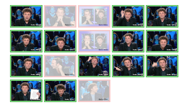
Figure 2: The application that help the annotator to invalidate audio segments according to the person appearing on the image.

An application has been developed to help the human annotator, by clicking on the images provided, to invalidate the segments that do not show the targeted speaker (Figure 2). More than 1900 hours of videos have been downloaded, and it took 224 hours to process the annotation. Finally, 480 hours of data have been annotated with the speaker identities. The ratio between the duration of the data to be annotated and the duration of the annotation itself is about 0.11. In [12], the manual annotation of a 2h08 corpus lasted 1h17, the ratio was about 0.60. Although it is less accurate, the duration of the annotation process, with the semi-supervised method is 6 times faster than a fully manual annotation.